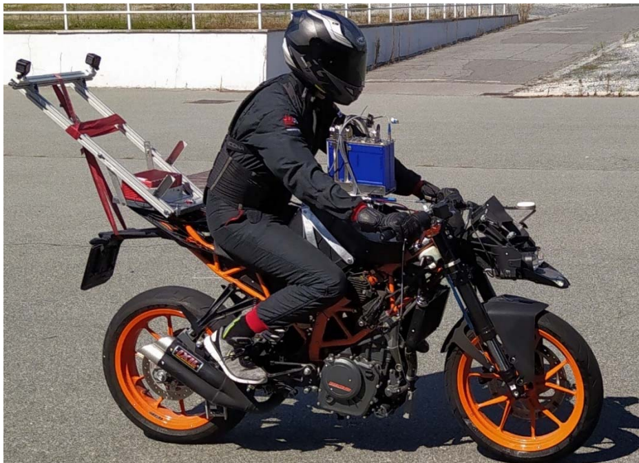
Fig. 1: Experimental motorcycle KTM RC 390 during a test ride.

For a study of a dynamic behavior of any land vehicle, the most prized information is arguably forces and their vectors in contact between the tires and a road, which the SADT tools mentioned in the introductory section allow to calculate. Precision of these calculations depends proportionately on accuracy and number of parameters that are measured during a test ride. This method can yield very accurate information independent of the type of road or road conditions, completely bypassing all shortcomings of mathematical tire models.